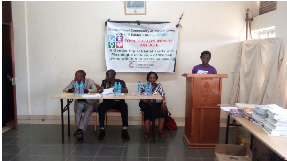
A Member of ICWEA in Mukono Presenting the needs and priorities of Women of living with HIV in as statement for International Women's Day

In Uganda this day was celebrated under the theme - Women's Economic Empowerment; A Vehicle for sustainable Development" and ICWEA commemorated it under theme "A Gender Equal Planet Starts with meaningful inclusion of Women Living with HIV in Decision Making in Mukono District Board room.